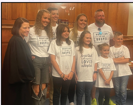
CHSWV Adoptive Family

Superheroes are fascinating to many children, and we can help them know it's not an imaginary superself but each person's real self that does the really important things in life.